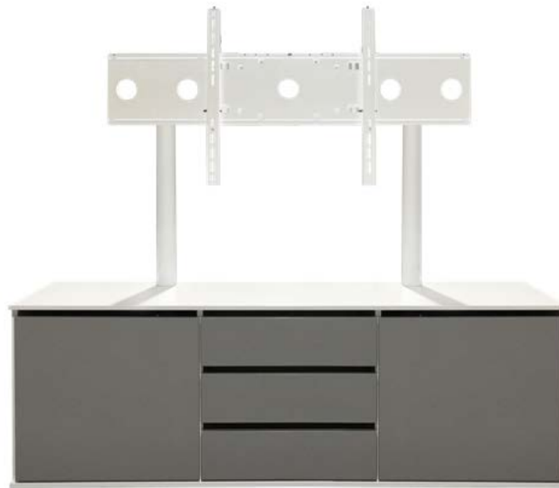
figure: Media Side select triple doors left and right, centrally optional cabinet module out of three drawers each, with adjustable feet